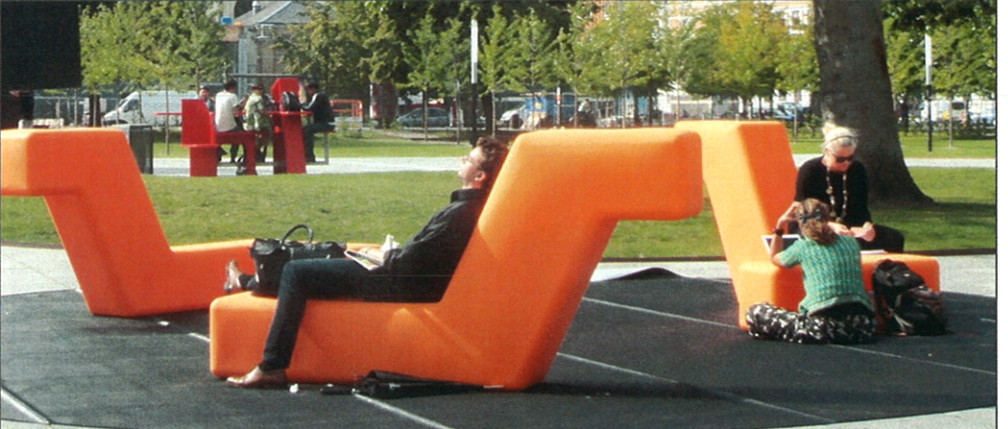
Interactive Sculptural Elements