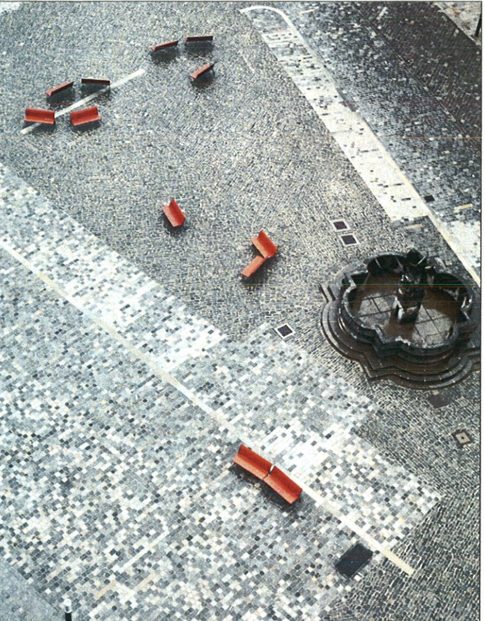
Note: Images identified here are not exact representations of proposed site elements. These images are shown to provide general character of site features.