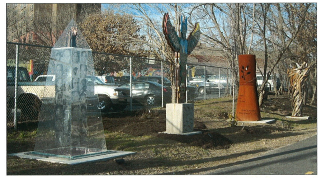
Existing Public Art, DC8 Totems, to be relocated (select examples)