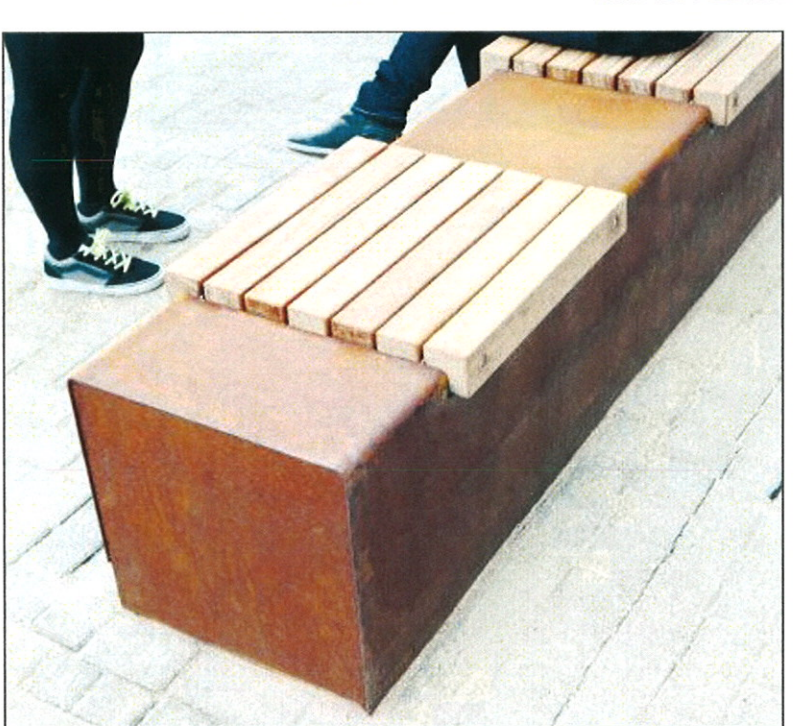
Bench with Back Backless Bench